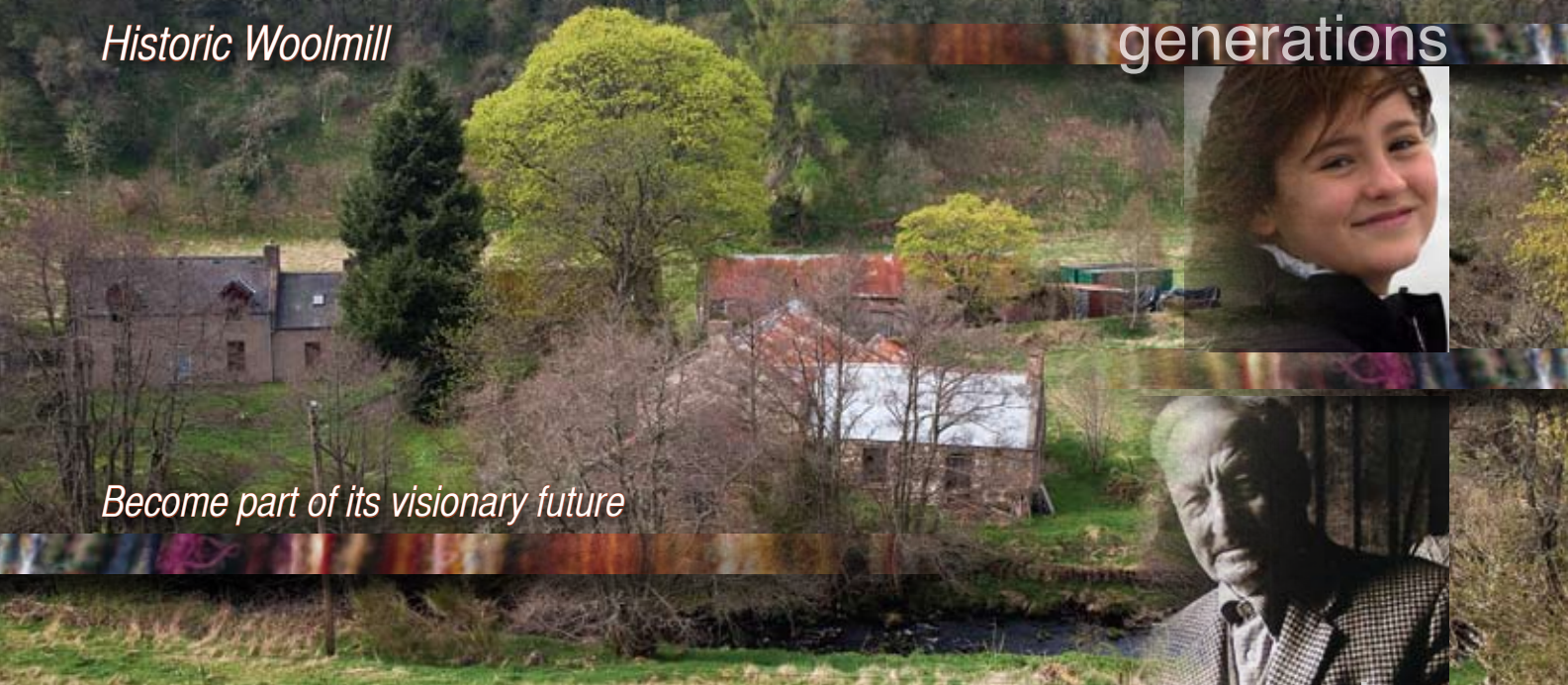
Become part of its visionary future